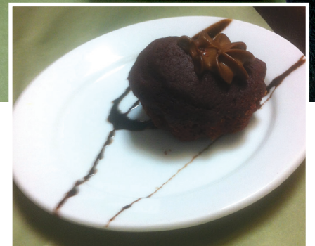
Red Velvet cupcake